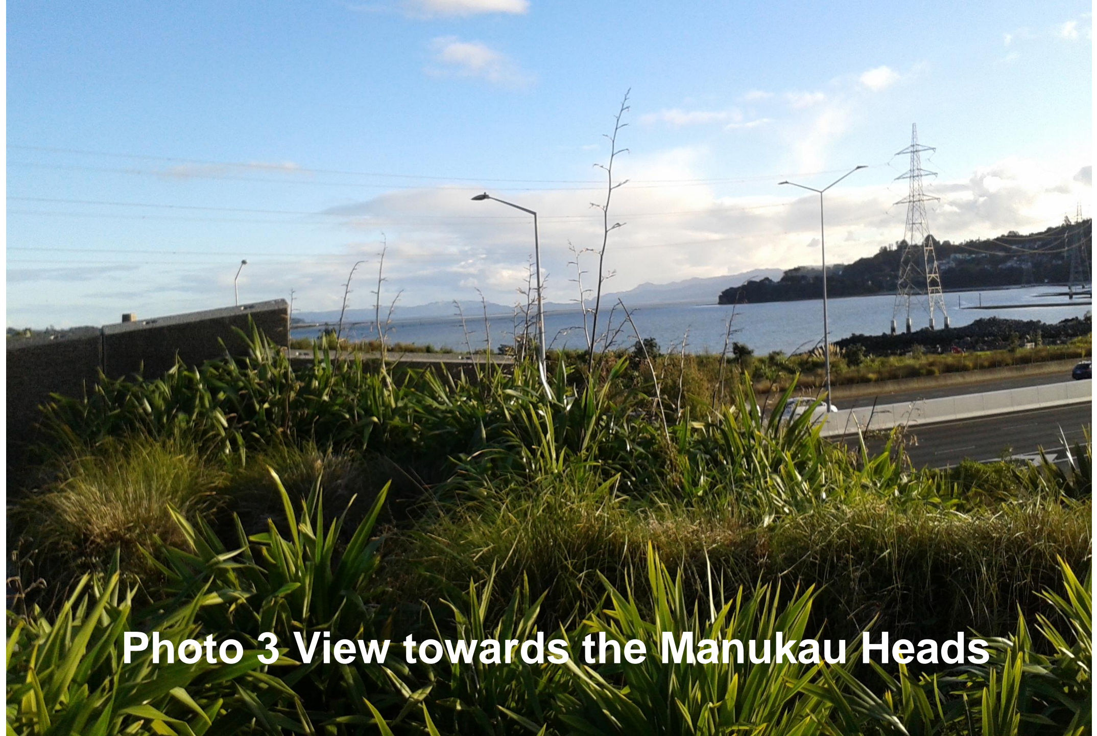
Photo 3 View towards the Manukau Heads