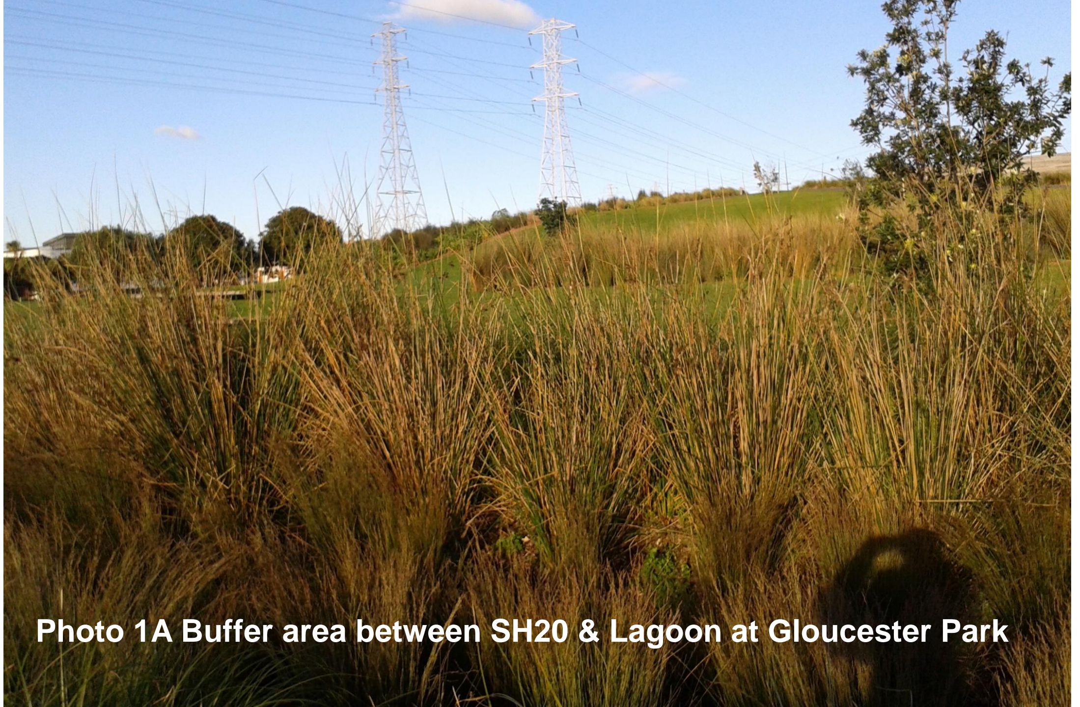
Photo 1A Buffer area between SH20 & Lagoon at Gloucester Park