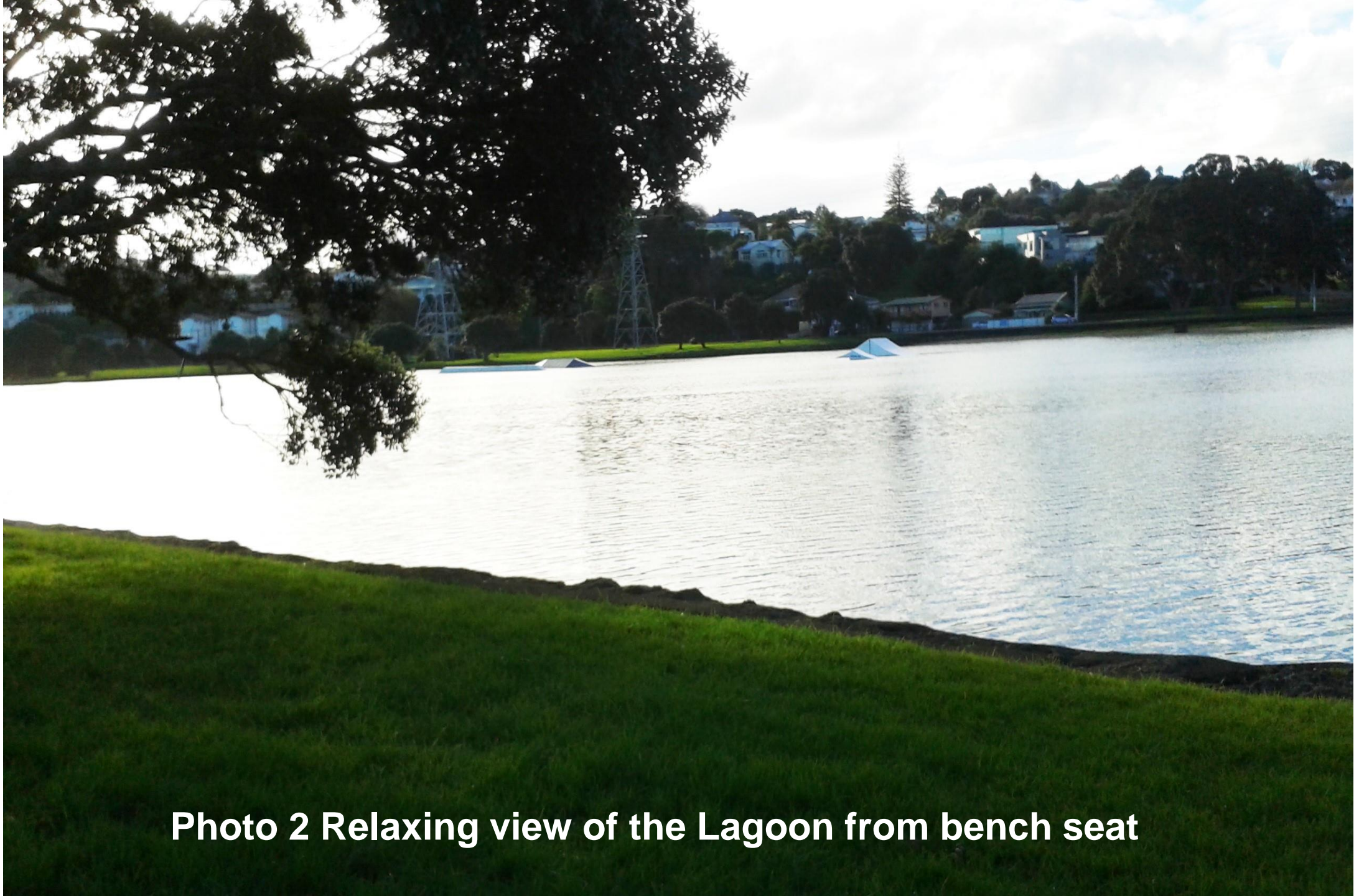
Photo 2 Relaxing view of the Lagoon from bench seat