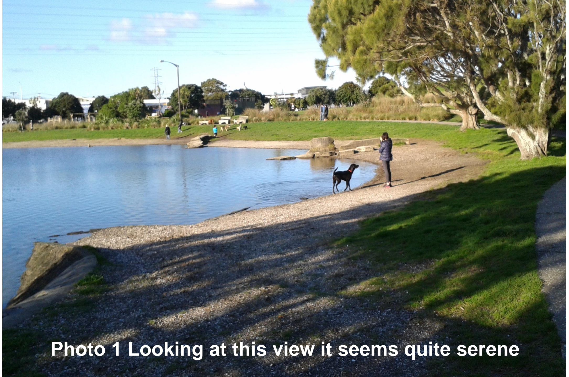
Photo 1 Looking at this view it seems quite serene