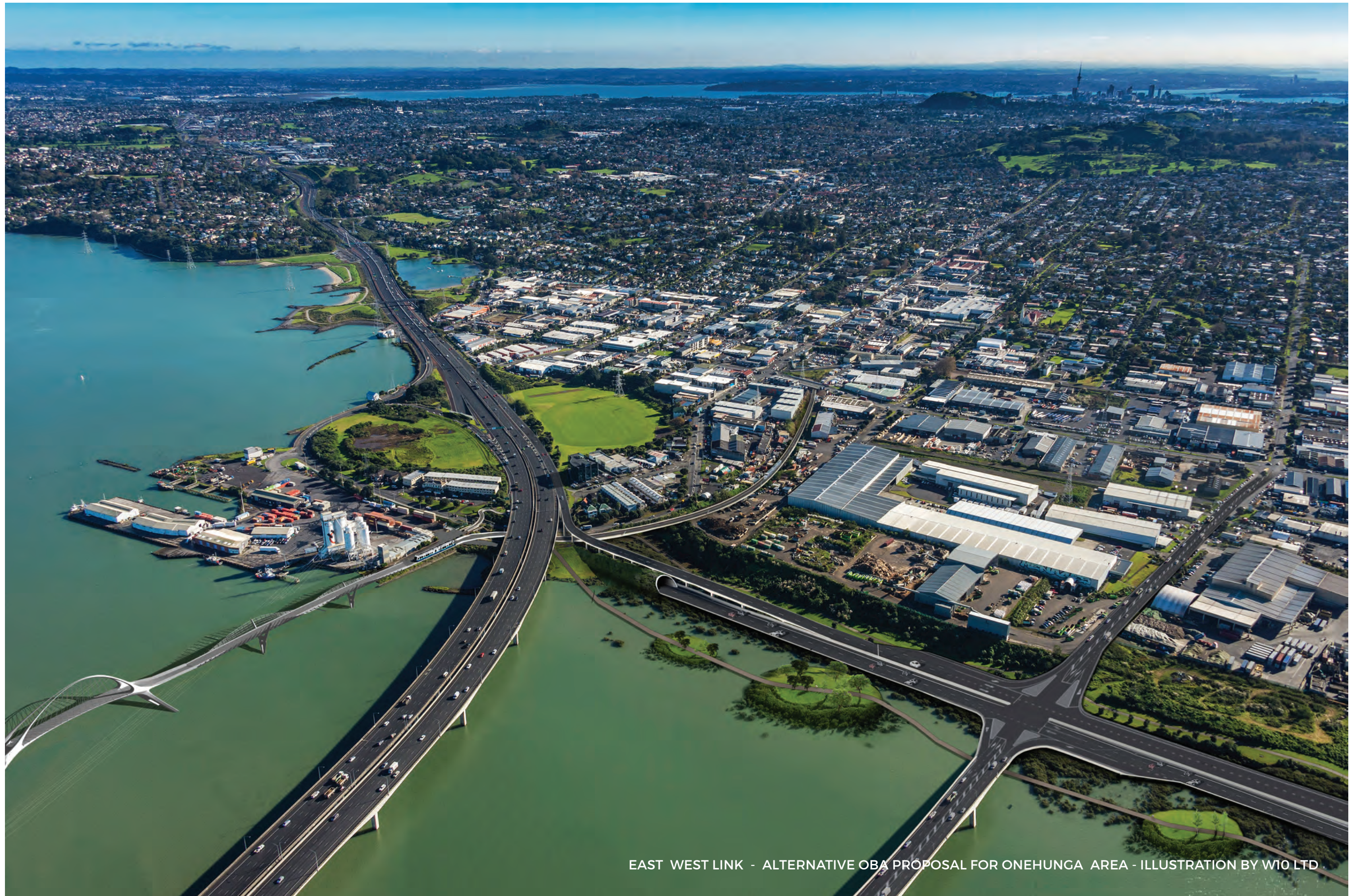
EAST WEST LINK - ALTERNATIVE OBA PROPOSAL FOR ONEHUNGA AREA - ILLUSTRATION BY W10 LTD