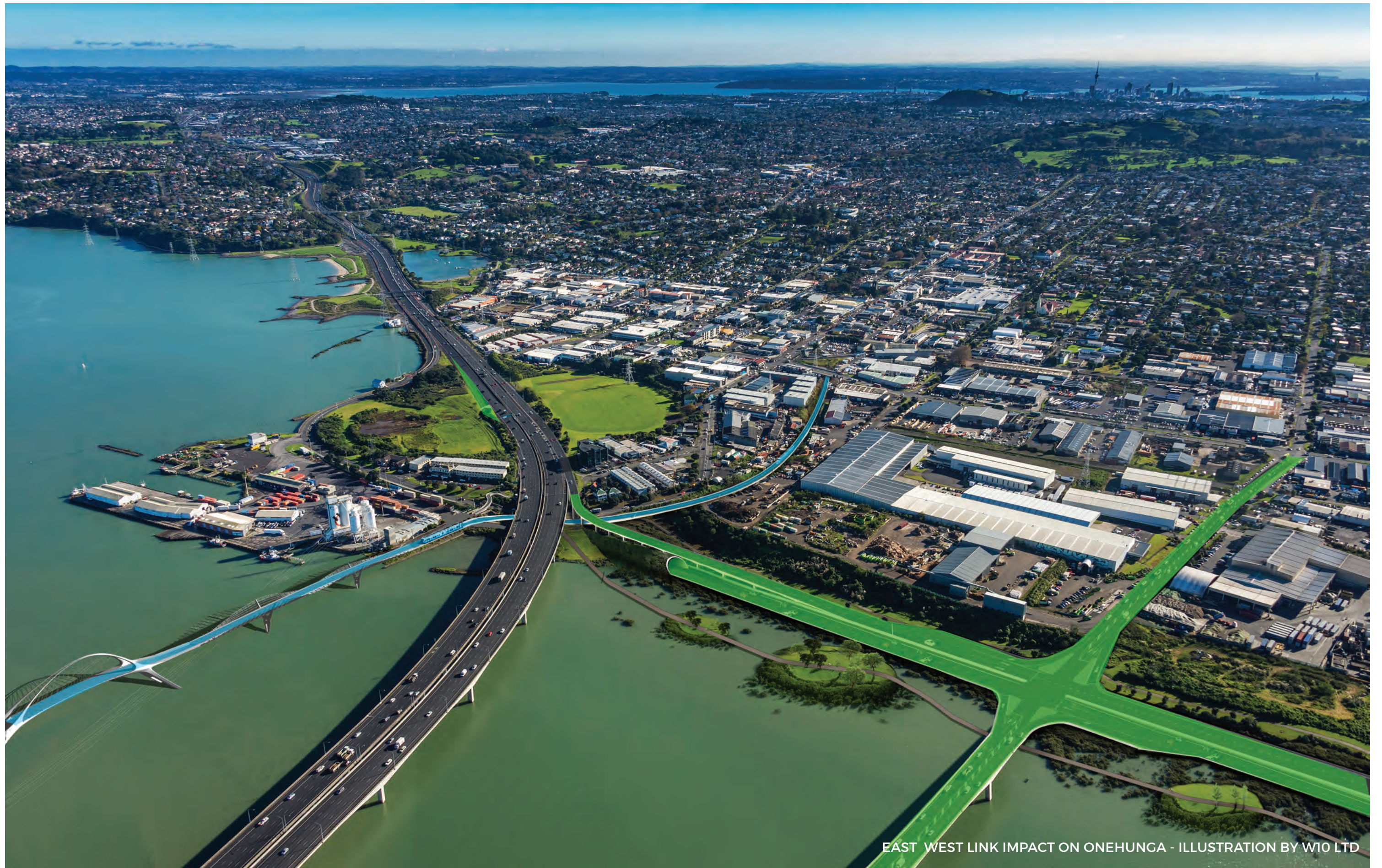
EAST WEST LINK IMPACT ON ONEHUNGA - ILLUSTRATION BY W10 LTD