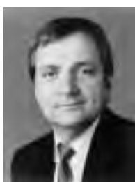
Klaus Töpfer United Nations Under-Secretary-General and Executive Director of UNEP

Protecting the ozone layer is the main goal of the Montreal Protocol on Substances that Deplete the Ozone Layer. Vital to all forms of life, the ozone layer is a protective shield above the Earth that filters out harmful ultraviolet radiation from the Sun.